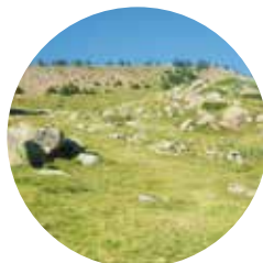
Orris de Mateu

Maiana: Old form of the Catalan word mitjà , meaning "middle"; the point between two well-defined extremes or places. It can also refer to division between two different properties or possessions.