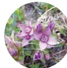
Field gentian ( Gentiana campestris )