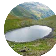
Els Meners lake

At 2,912 metres altitude, La Serrera peak is the fifth-highest summit exceeding 2,900 metres, out of a total of six in Andorra.