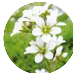
Saxifrage ( Saxifraga aquatica )