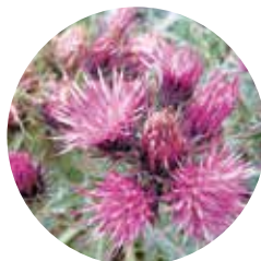
Pyrenean thistle ( Carduus carlinoides )

Serrera: From the Latin serra , "uninterrupted chain of mountains".