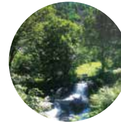
Claror i Perafita rivers