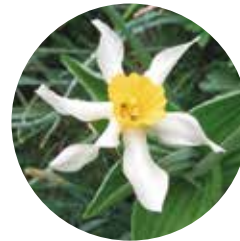
Wild daffodil ( Narcissus Pseudonarcissus )

Laurèdia: according to Joan Coromines, is the ancient name for Lòria (Sant Julià de Lòria), which according to the Act of consecration of the cathedral of La Seu dated 839, is a Latin name for a person Lauridius , although it might also come from Salòria as it seems to contain the same ending, and in this case the use of the article "sa" would indicate a name referring to water.