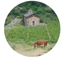
Sant Mateu de Pui d'Olivesa

Fantastic circular route to Sant Julià de Lòria parish, where you can discover the best known places in the south valley. The alternation of open areas with amazing views over the parish and imposing woodlands make this a very interesting route for enjoying landscapes.