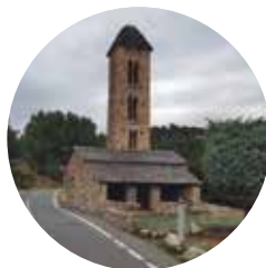
Sant Miquel d'Engolasters Church

Coll Jovell: A hill amidst mountains, a depression between the mountains. Etymology: It is believed that the word may originate from the Latin 'collu' which means small mountain. Jovell means an easy passage between two mountains or a rounded crest, which would originate from the Latin 'iugu', 'jou'.