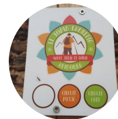
Signs for Tomb Lauredià

The Tomb Lauredià is a popular route that runs between the town of Sant Julià de Lòria and the halfway point of the mountain. This route is of very low technical difficulty. It provides magnificent views over Sant Julià de Lòria and allows you to visit the picturesque towns of Aixirivall and Nagol.