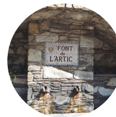
Font de l'Artic water spring