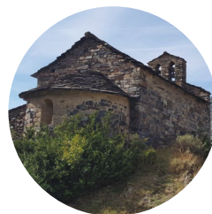
Sant Serni de Nagol

Nagol: According to the book "Recull topogràfic per la seca, la meca i les Valls d'Andorra", Nagol means "pot of water". Latin etymology aquale with the addition of the preposition -en; which gives way to En Agol .