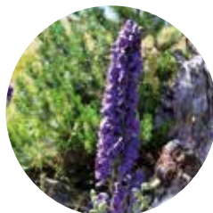
Monkshood ( Aconitum Napellus )

Pal: From the Latin palu , meaning “stick”. This village is close to the western border. In previous times, people could get disoriented when great snowfalls and storms hit. High and thick perches were set up to avoid this. The Catalan word pal forms part of many place names in the Pyrenees.