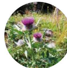
Woolly thistle ( Cirsium eriophorum )