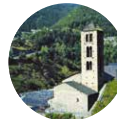
Church of Sant Climent

This simple hike is ideal for completing with the whole family on a hot summer afternoon. Given that the route passes only 800 metres from the idyllic village of Pal, it is well worth paying a visit. You can also see the church of Sant Climent and the Romanesque interpretation centre.