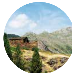
La Capa highlands